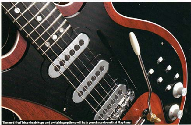
The modified Trisonic pickups and switching options will help you chase down that May tone