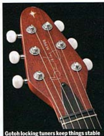
Gotoh locking tuners keep things stable

although it shouldn't be quite so comfortable on paper, it's truly wonderful to play. With a nut width of just over 45mm, a zero fret and a familiar old Fender-type 184mm radius, the benefits to overall tone of necks of this size shouldn't be underestimated.